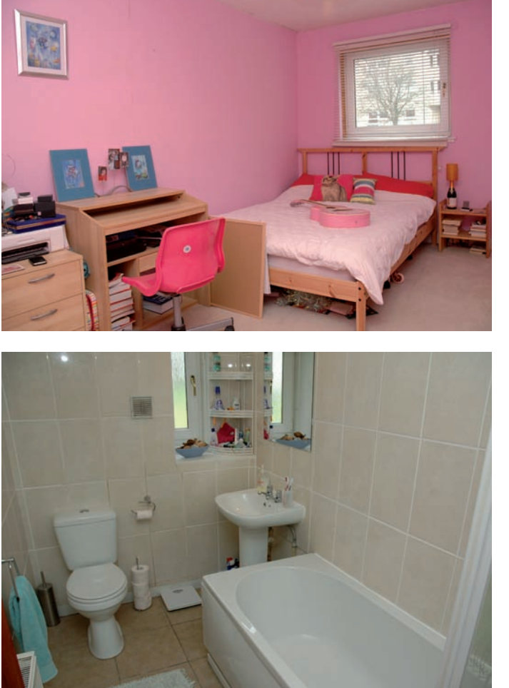
Flat 0/2, 9 Fisher Court, Dennistoun, Glasgow G31 2HP