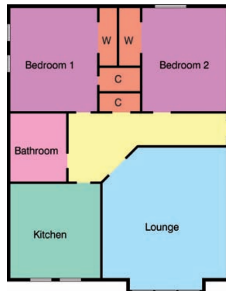
Floor plans are indicative only - not to scale.