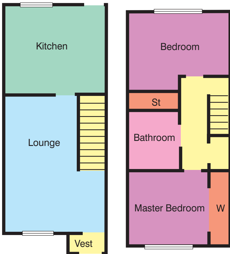
Floor plans are indicative only - not to scale.