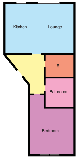
Floor plans are indicative only - not to scale